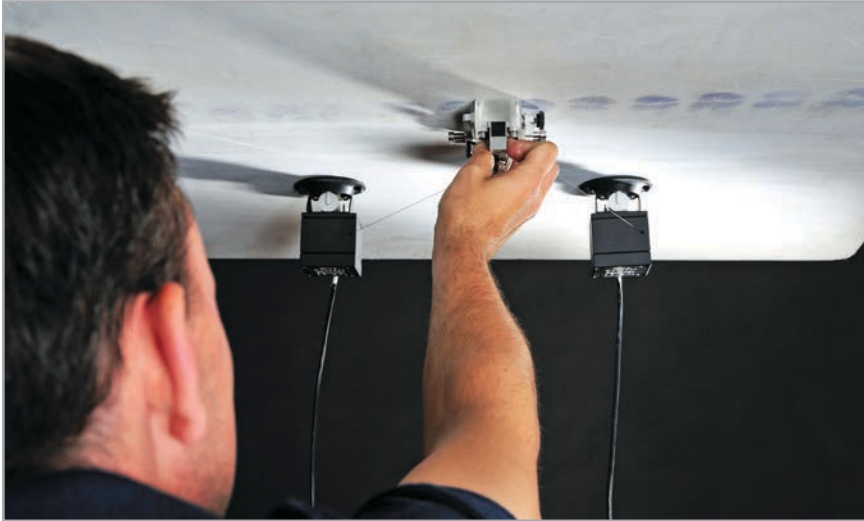
Tracer - Inverted scan inspection

Tracer is a versatile freehand scanning system that calculates and outputs accurate X-Y positional data for C-scan inspections without the constraints of a scanning frame. Tracer is ideally suited to operate with linear array probes to provide a fast, simple and flexible portable C-scan inspection kit.