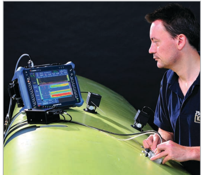
Typical scanning application